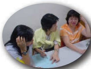
... Head-scratching time