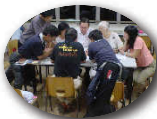
... TAF quiz... working together

We pray that the Word ministry will help to build and strengthen our members and friends in their spiritual lives, so that we may all be able to truly say, that, "for me to live is Christ, to die is gain!"