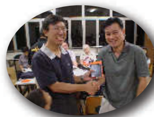
... Prize presentation